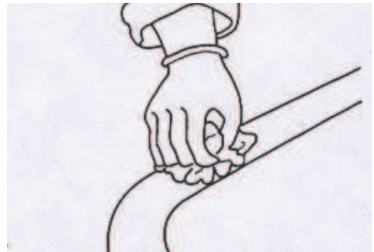
Cleaning/Activating the windscreen black ceramic coating with U-Cleaner.

U-Cleaner/Activator is a Silane polymer based cleaner/activator able to remove the contamination of the glasses. Its chemical nature also enhance the adhesion promotion properties of the U-primer 130 and the adhesive during the glass replacement contributing to the perfect bonding of the glass. Due to its chemical base it has non-filming properties.